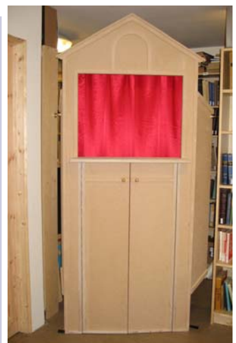
The new puppet theatre at the Armenian Institute Library.