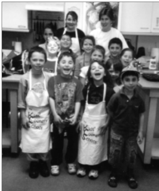
The little chefs at Children's Cookery Workshop.