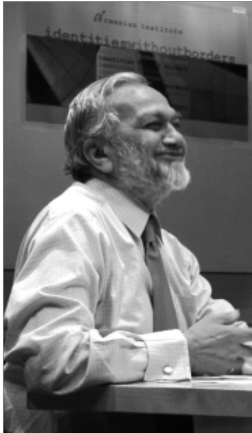
Prof. Bhikhu Parekh